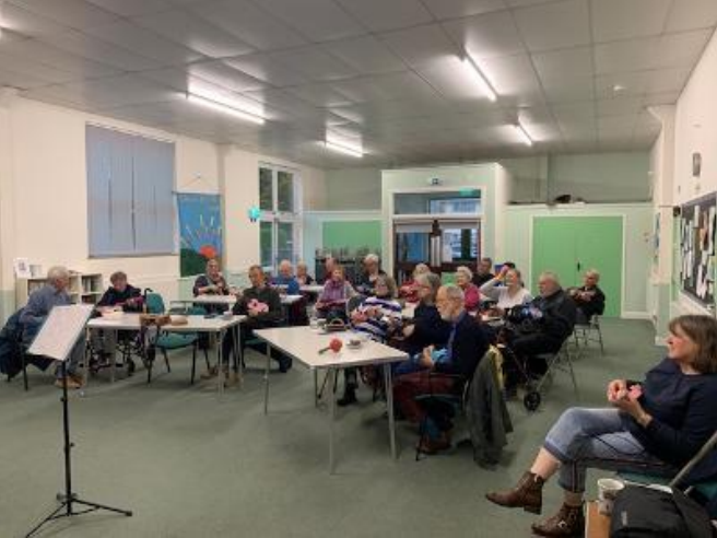
A couple of images of us all having some fun

A Night at The Museum has been arranged for 1<sup>st</sup> Dec – a chance for those going to have a drink, some nibbles, and a tour of Corinium Museum in Cirencester.